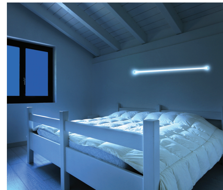
SHINING EXAMPLES (clockwise from above) A smart light from Luminous (above); Anusha Technovision has installed lighting controlled through a central system in this home (left); light controlled from a smartphone

"Smart switch-off, night lamp, multi scene and colour changing options, are a few of the smart lighting devices popular at Luminous," says Jitendra Agrawal, Senior Vice President, Luminous Power Technologies. Smart switch off (₹1,200) ensures that the light switches off a few seconds after you switch it off to ensure there is enough time to leave the room. Night lamp (₹1,250) is a lighting device with two small lamps fitted on the sides which work as dim blue lights while you are sleeping at night. Multi scene (₹1,499) is a device that lets you have multiple levels of illuminations in the same light fixture. The colour changing batten (₹900) has a LED batten that allows you to change the colour with the flick of a switch. That's not all, today we